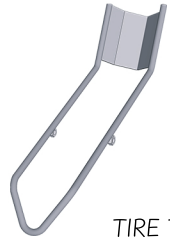
TIRE TOTTER CRADLE